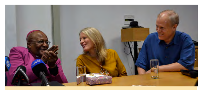
Archbishop Desmond Tutu officially endorsed GERI in 2013.

The methodology of Gender Equity and Reconciliation has—for 30 years—been specifically developed, practiced, and refined to facilitate this very transformation. Our methodology is summarized in Martin Luther King, Jr.'s declaration that injustice and corruption will never be transformed by keeping them hidden, but only by bringing them out into the light, and confronting them with the power of love.